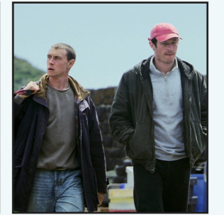
Rose of Nevada