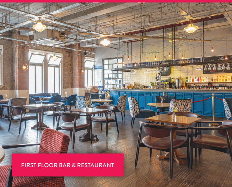
FIRST FLOOR BAR & RESTAURANT